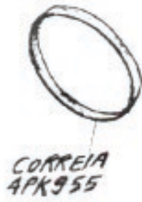
LAY-OUT DAS CORREIAS

IMPORTANTE: DESCARTAR O "SUPPORTO DO FILTRO" ORIGINAL, PUIS O MESMO FORÇA A PONTA DO SUPPORTO COMPRESSOR OCASIONANDO QUEBRA